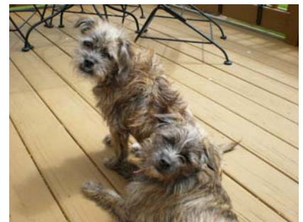
Leland & Lillian These two terrier/Chihuahua mix pups were the first adoptees of the Mt. Juliet Animal Shelter. Taken to their "forever home" on December 13, 2008 they now know what love is (and so do their owners).