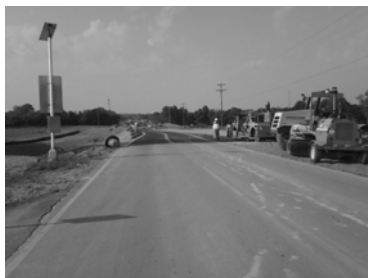
Fresh striping on Curd Rd.

The roadway necessary for traffic movement south of the Mt.