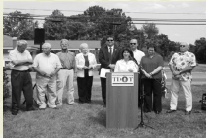
Ground Breaking Ceremony July 21, 2009

Thanks to the Federal Stimulus Package, Mt. Juliet Rd. is now completing its entrance into the 21st century. $8.9 million will be spent on the road itself. This is in addition to the WWUD cost of moving water lines, City of Mt. Juliet cost of moving sewer lines, MTEMC for power lines, Piedmont Gas for natural gas lines, TDS for telephone. The years to complete, end-patience when it comes power outages, large a temporary problem to a artery between I-40 and completed in the summer million and the result is a eased the traffic getting and points south. Phase and goes for 2.2 miles to the road was awarded to is completed Mt. Juliet will lanes, 2 south bound lanes, turning lane and bike lanes. A temporary traffic signal will be installed at Charlie Daniels Parkway during the widening and a permanent signal will be placed when construction is finished. If you have any questions or concerns during this process we invite you to call any of the numbers listed below.